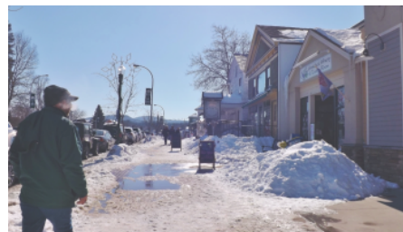
Adirondack Winery to celebrate 9th anniversary in a Lake George 365 environment