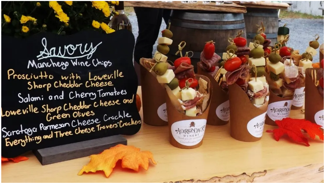
At the groundbreaking ceremony, Adirondack Winery offered samples of charcuterie they will offer in the new facility.

The new tasting room will host events already popular at their Lake George sites such as Uncork & Craft , and they will introduce wine knowledge classes.