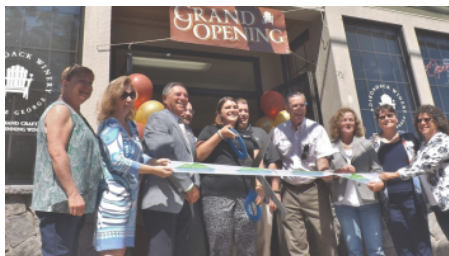
Adirondack Winery cuts ribbon on new Bolton Landing tasting room