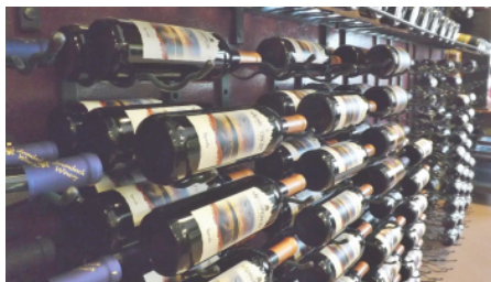
Adirondack Winery to celebrate 10-year anniversary with weekend of events